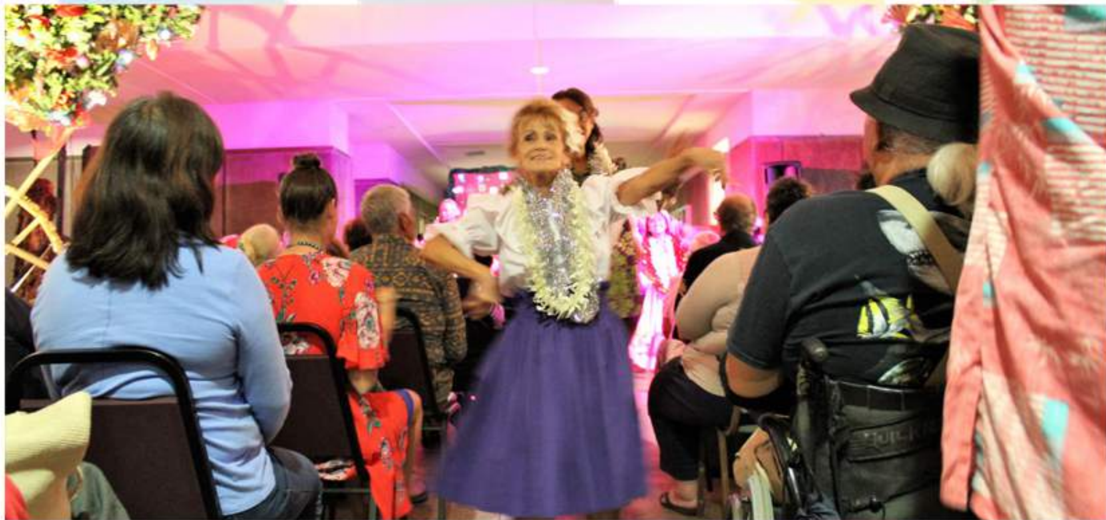
Hula Hypertension The Ola Hou I Ka Hula Hypertension class performed at the Hawai'i County Building for "Magic of the Season" on Friday, December 14.

Here is some of what Hui Mālama Ola Nā 'Ōiwi is doing to help our Hawai'i Island 'ohana Live Longer and Feel Better, Together. Come join us for upcoming events and classes!