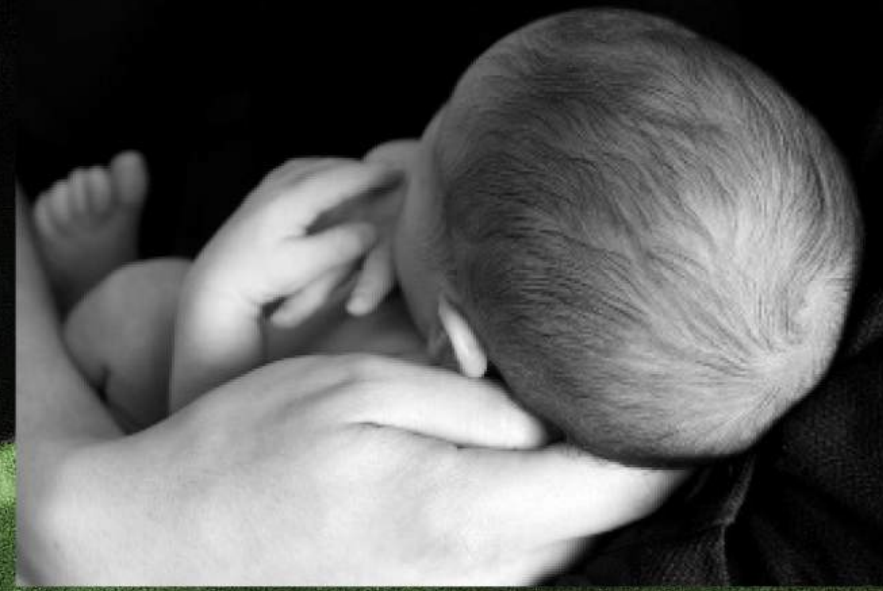
Hui Mālama staff 'ohana